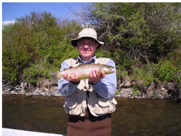
Eat, fish, and have fun!