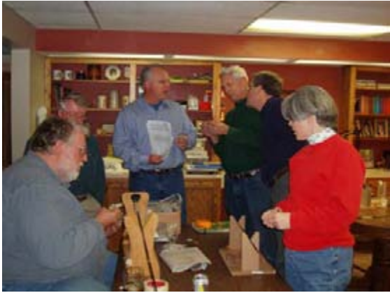
Passing on a great tradition.