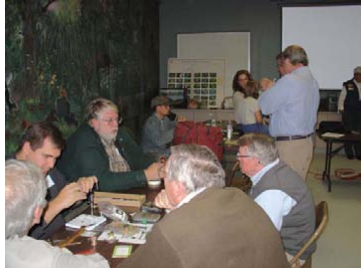
DCFF members enjoy learning from each other.