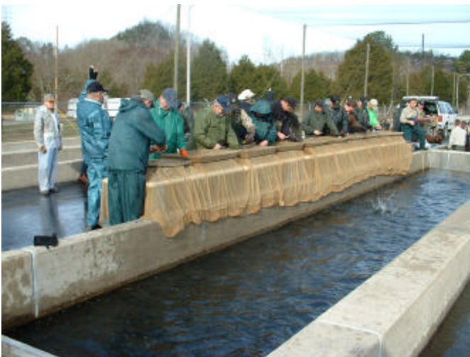
Fin clipping is a great help to the Kentucky Department of Fish & Wildlife.