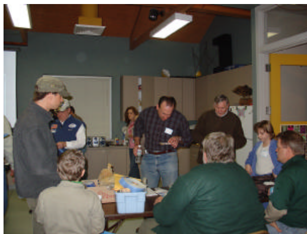
DCFF members enjoy learning from each other.