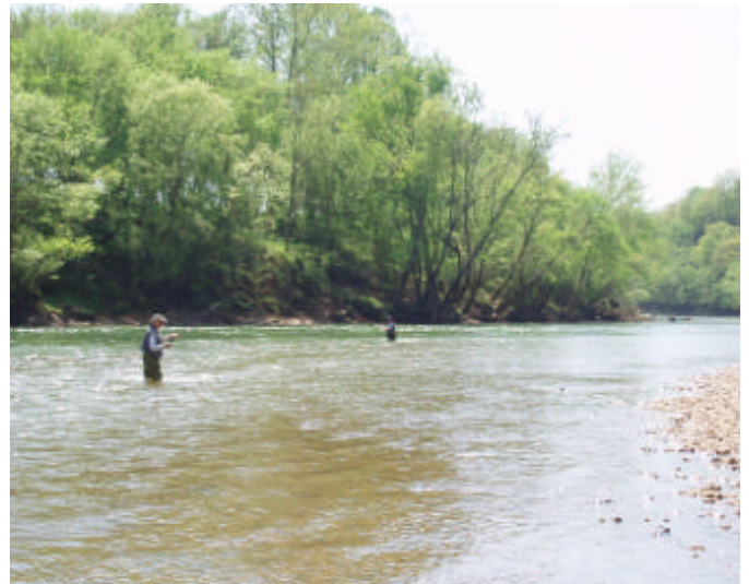
New members fish the Cumberland after the Entomology Class armed with new knowledge.